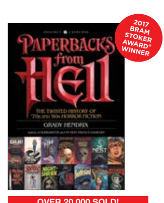
Paperbacks from Hell